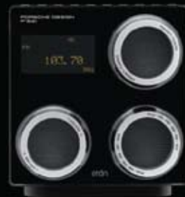
Table Top Stereo System with Clock for iPod/iFM Ready/AM/FM/Stereo/HD Radio (Radio Data System) Some say it's enough for a radio to sound good - we think it takes more than that. The Porsche Design P'9120 by Etón captures the essence of what made Porsche Design legendary: a clean, sleek style. A design that is engineered. A form that reflects function. In the audio performance space true to the Etón name - presenting a new generation of radios.